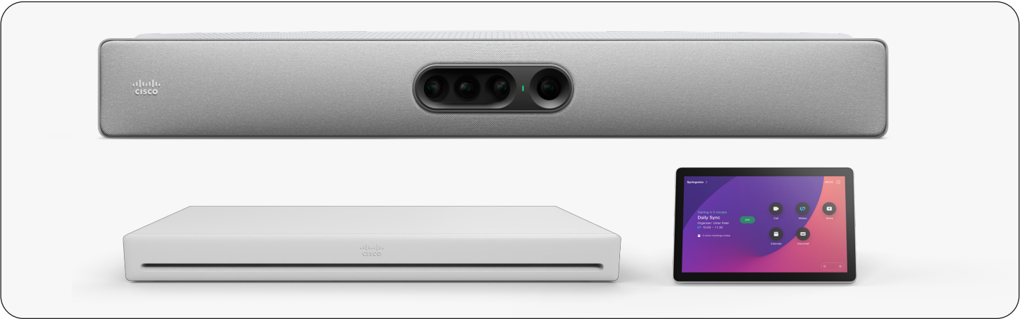
Figure 2. Main components of the Cisco Room EQ bundle: Cisco Codec EQ, Cisco Quad Camera, and the Cisco Room Navigator touch controller