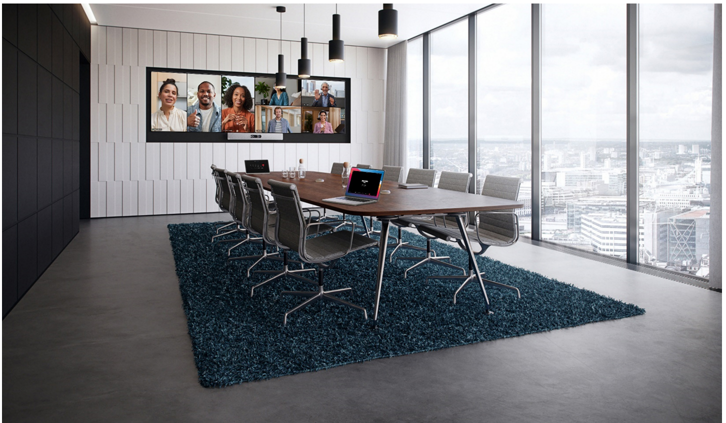
Figure 1. The Cisco Room Kit EQ in a conference room with the Quad Camera, the table-stand Room Navigator, and the Cisco Table Microphone Pro.

The Room Kit EQ provides optionality and extensibility with a highly modular setup to easily add touch controllers, cameras, speakers, microphones, and other room peripherals – easing the configuration and scaling of complex, multi-component audiovisual environments. This solution is rich in functionality and experience yet easy to deploy, maintain, and scale to your workspaces – and comes with unified cloud device management and workspace analytics in Control Hub.