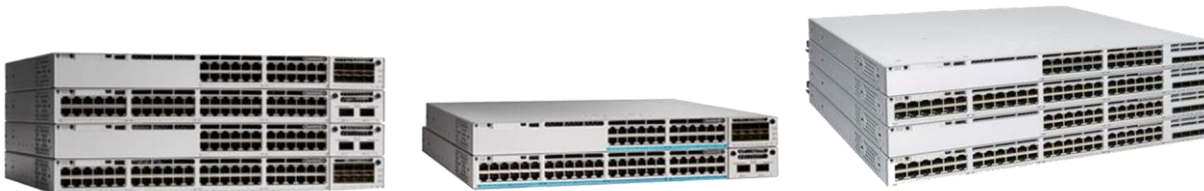
Figure 1. Cisco Catalyst 9300 Series switches

The Cisco Catalyst 9300 Series is made up of nineteen modular uplink switch models and fourteen fixed uplink switch models.