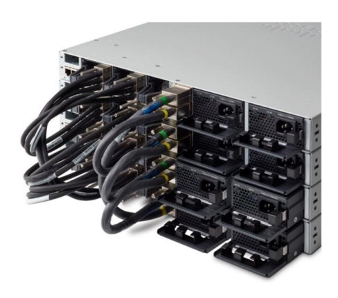
Figure 7. Cisco Catalyst 9300 Series StackPower