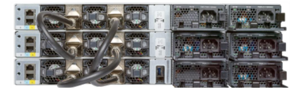
Figure 6. Cisco Catalyst 9300 Series fixed uplink models with optional stack kit