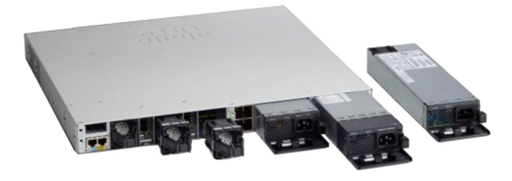
Figure 4. Cisco Catalyst 9300 Series Dual Redundant power supplies

Cisco Catalyst 9300 Series switches support dual redundant power supplies. The switches ship with one power supply by default, and the second power supply can be purchased when the switch is ordered or at a later time. If only one power supply is installed, it should always be in power supply bay #1. The switches also ship with three field-replaceable fans. Power Supplies are common across the Catalyst 9300 Series.