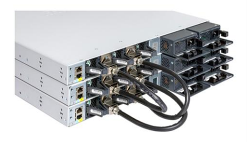
Figure 5. Cisco Catalyst 9300 Series modular uplink models stack (C9300/C9300X SKUs) and fixed uplink models stack (C9300L SKUs)

Table 5 lists the supported stacking options.