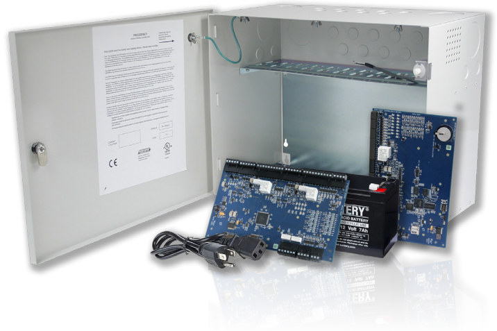
PW7000-Series Access Control System.

The PW7K1IC comes with 2 on-board reader ports that support multiple reader communication protocols including Wiegand and OSDP (V2) Secure Channel Protocol (SCP). OSDP SCP is now supported across all the intelligent controller and reader board hardware. PW7000-series control panels and I/O boards are backwards compatible with PW6000-Series*.